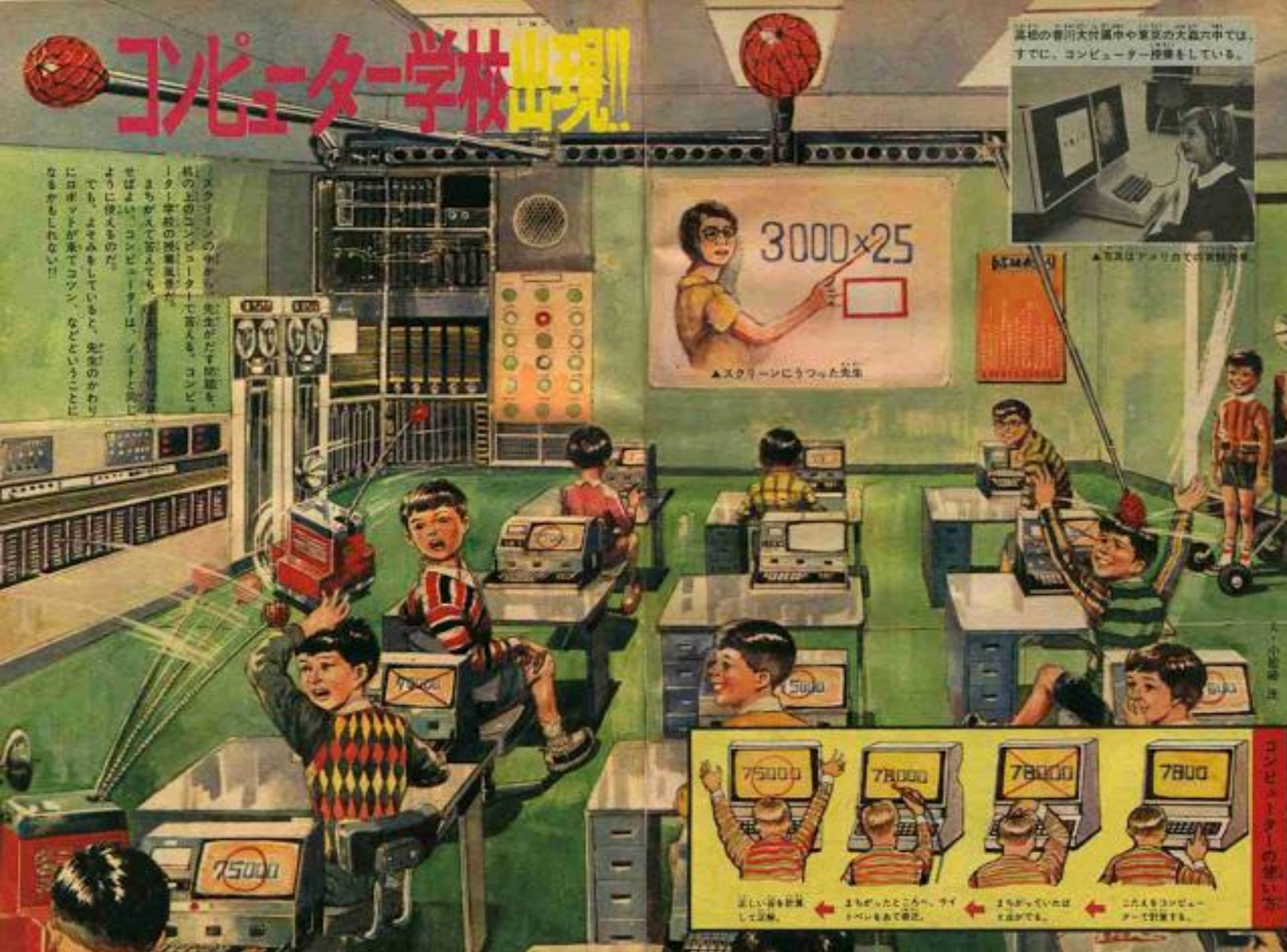
Computopia: A vision of a future classroom by Shigeru Komatsuzaki, 1960s